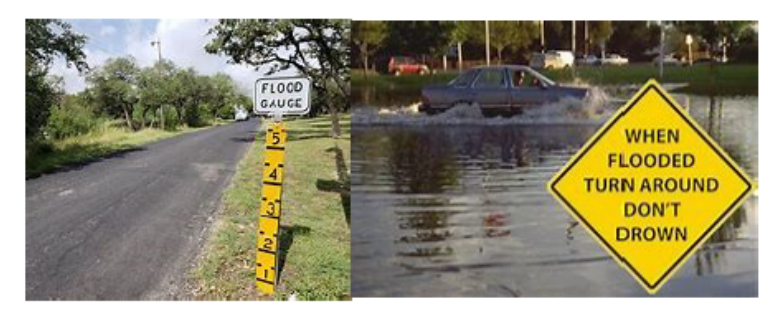
Flash Flood Facts

Flooding is the deadliest weather hazard in Missouri. From 2015 through 2019, 40 of Missouri's 50 flooding deaths were people who had been in vehicles during a flash flood .