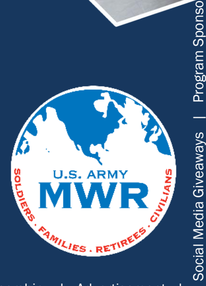
Sponsorship and/or advertisement does not imply federal endorsement.

Social Media Giveaways | Program Sponsorship | Event Sponsorship | Advertisement | Social Media Giveaways