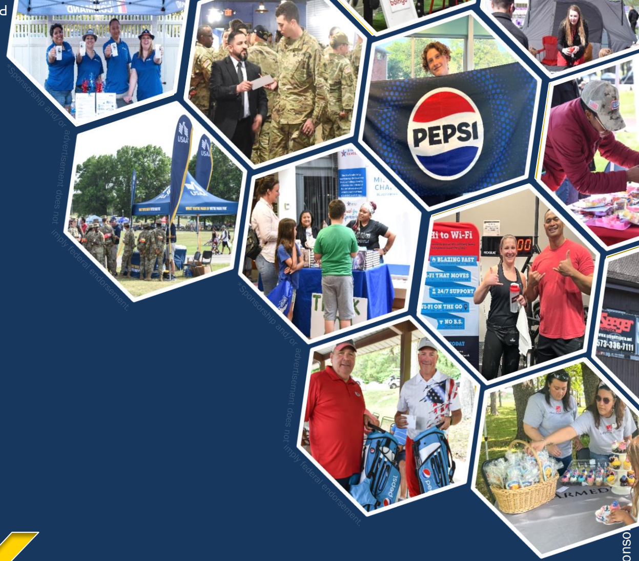
Sponsorship and/or advertisement does not imply federal endorsement.